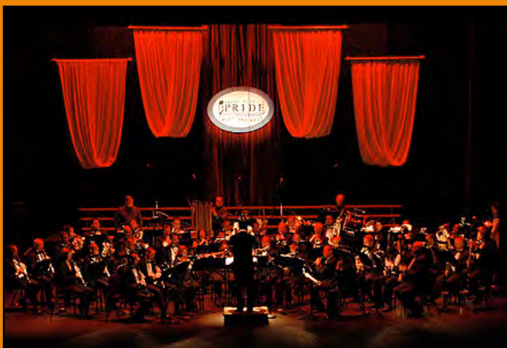
South Florida Pride Wind Ensemble with Gary Burton