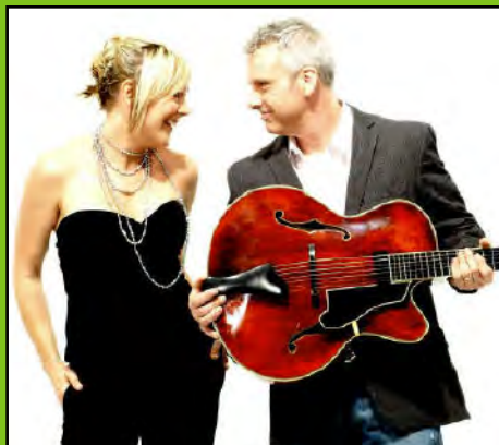
Davis & Dow