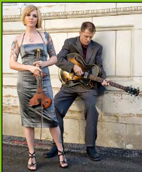
The Nouveaux Honkies

FLORIDA'S ONLINE GUIDE TO LIVE JAZZ & BLUES