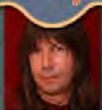
DECEMBER 9 PAT TRAVERS