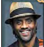
DECEMBER 2 KENNY NEAL