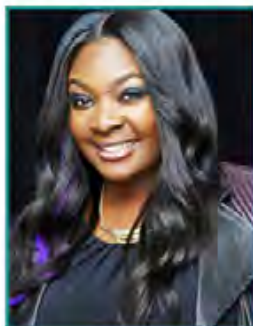
American Idol winner Candace Glover