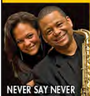
NEVER SAY NEVER